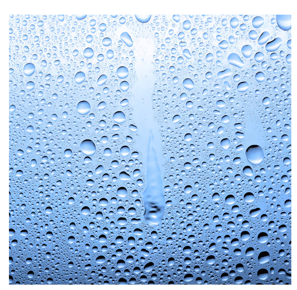
Indoor-generated moisture and moisture-related indoor air quality problems in houses and units in multi-unit residences will be discussed in this helpful guide.

For renters, report all plumbing leaks and moisture problems immediately to your building owner, manager or superintendent. For the owners of condominiums, if the moisture problem is coming from inside your unit, it is likely something you will have to deal with. If the moisture is coming from outside the unit (leaks through walls, windows, doors, ceilings or plumbing), contact your condominium manager.