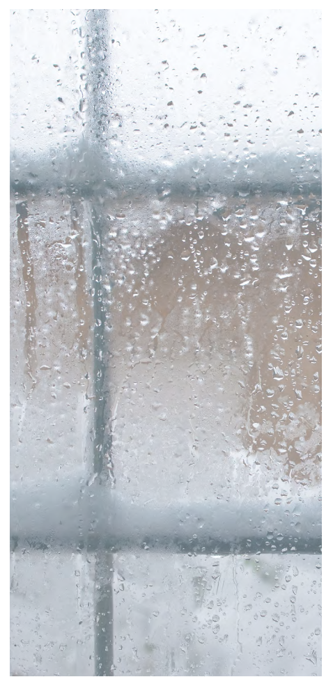
When the temperature becomes colder outside, the risks of condensation can increase.