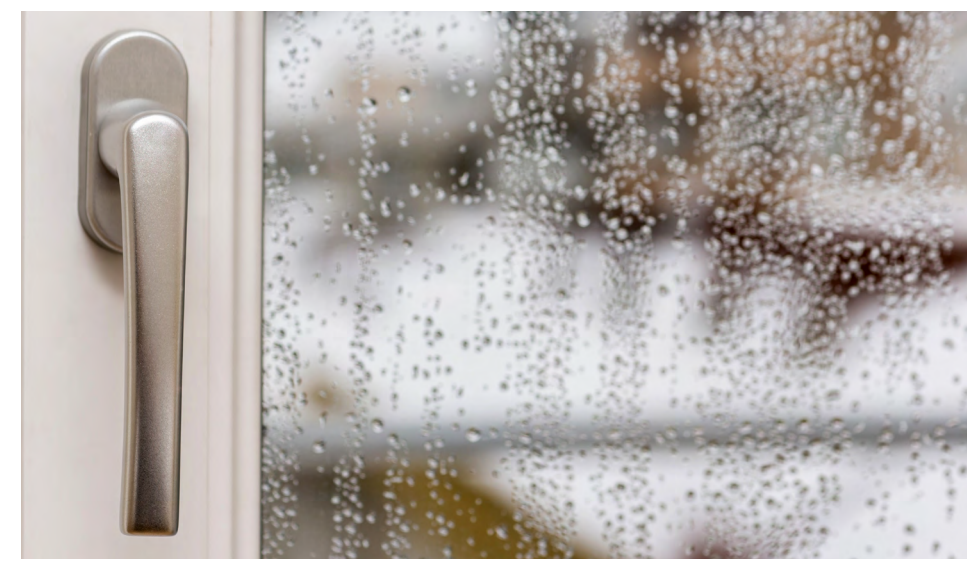
Moisture condenses when cold surfaces meet warm moist air. Condensation will make surfaces wet, which can cause water damage or help mould/mildew grow.

A hygrometer is an instrument used for measuring the moisture content in the atmosphere.